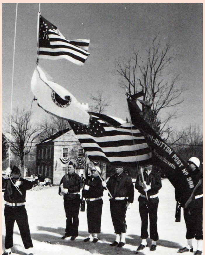
AMERICAN LEGION RAISES THE 1786 FLAG AND THE BOYLSTON FLAG

However, the Bicentennial Ball turned out to be too large a gathering for the Hastings ballroom, so the many costumed dancers and happy revelers instead showed off their dancing moves at the Tahanto High School Gymnasium.